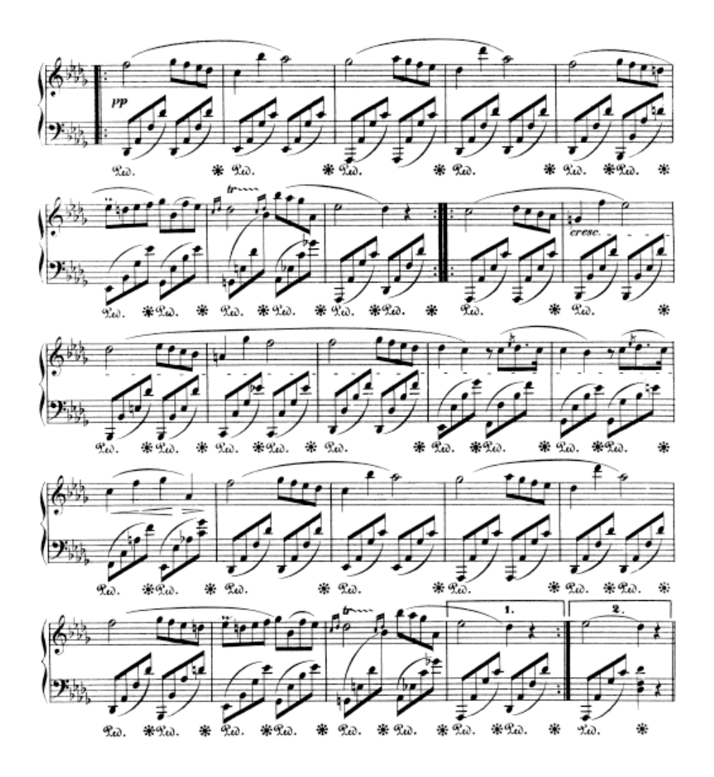
Ex. 4. Frédéric Chopin, Sonata No. 2 in B-Flat Minor, Op. 35, III ("Funeral March"), Trio.

As exemplar of ineffability in music, then, this passage, with its silken accompaniment and vox angeli sopranissimo melody, seems to have reached its mark. (See Example 4 .)