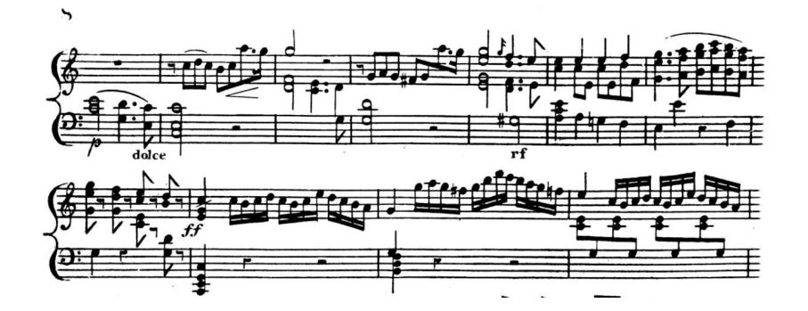
Ex. 5. Jan Ladislav Dussek, The Sufferings of the Queen of France, from the "Apotheosis" section.

had actually been a friend of the composer. This passage is found in the closing section, "Apotheosis," which follows the guillotine's fatal stroke. In Eample 5 , the passage in question, the horn-fifth motive—identical to that used by Beethoven as motto for his Op. 81a "Lebewohl" sonata sixteen years later—is answered by an upward-reaching figure, clearly suggestive of a soul freed from earthly bonds.