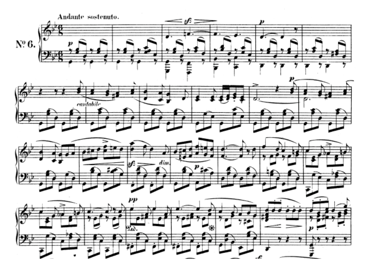
Ex. 2. Mendelssohn, Song Without Words, Op. 19b/6, "Venetian Boat Song," opening.

melody, ardent or melancholy, over a {}^{6}_{8} or {}^{12}_{8} accompaniment. But because it was sung by a boatman—the third wheel, as it were, to what was presumed to be the romantic couple snuggling in the gondola—it had a strong serenade component; it never ventured to the extremes of passion, and it always relied on the gentle rhythms of the boatman's oars dipping in the canals. Mendelssohn's designation of "Venetian Boat Song" thus set explicit expectations for his listeners, who understood the essential conceit: "as if sung by a gondolier." Nearly two hundred years later, this more distant image is something we might easily overlook.