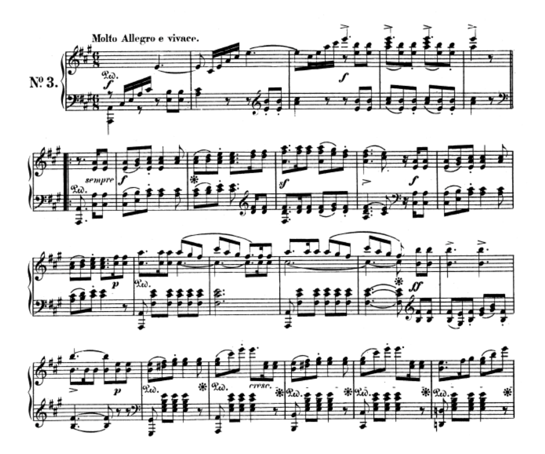
Ex. 1. Felix Mendelssohn, Song Without Words, Op. 19b/3 ("Hunting Song"), opening.

hunting horns" (mm. 1–2 and throughout, in various forms), one is no longer in the realm of "just the song as it stands there," because it is irrefutably about the Hunt, via the clear imitation of the instrument associated first and foremost with hunting.